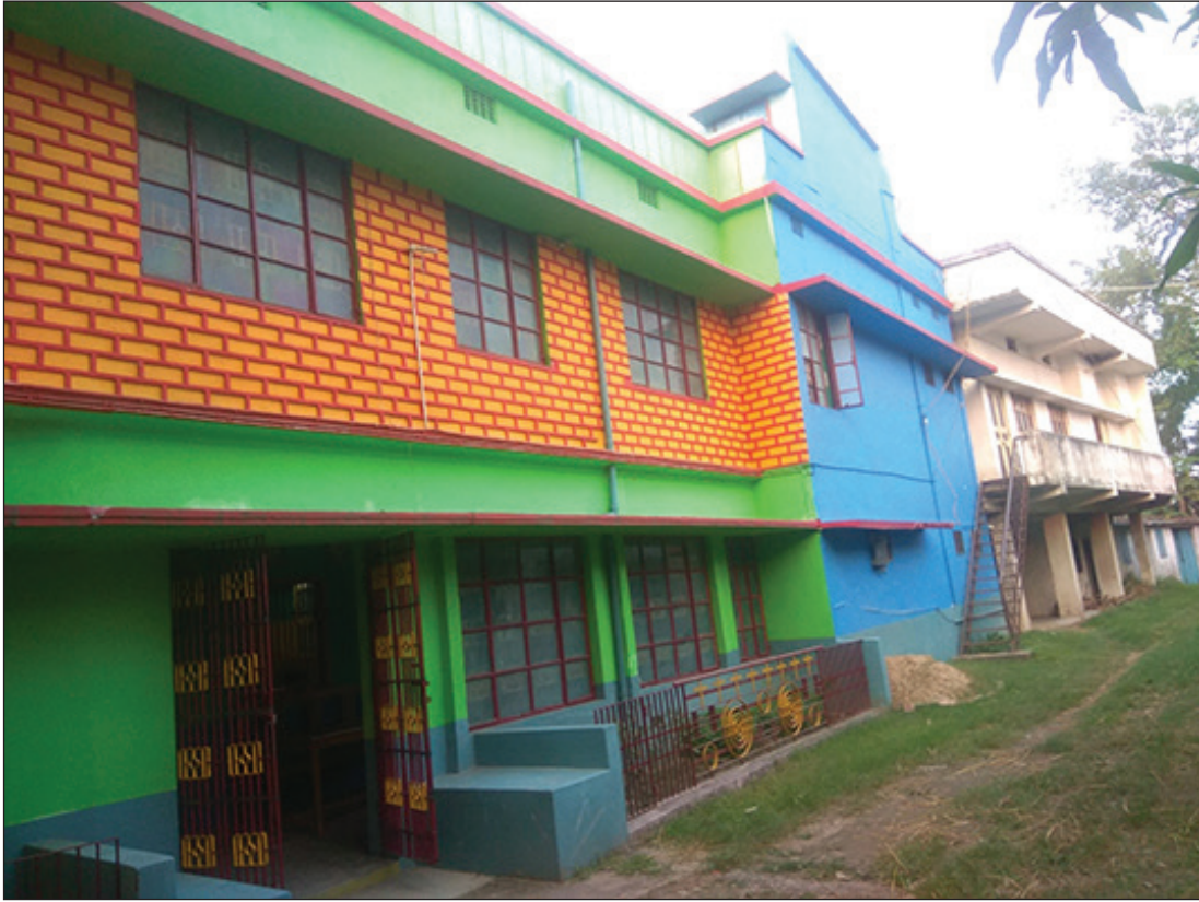
The Bridge Course program is operated in a separate building and offices on the grounds of the Sacred Heart Convent in Bettiah, Bihar.