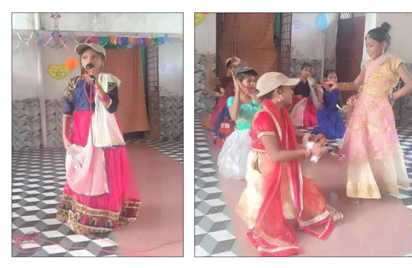
ABOVE and BELOW: Bridge Course girls performing