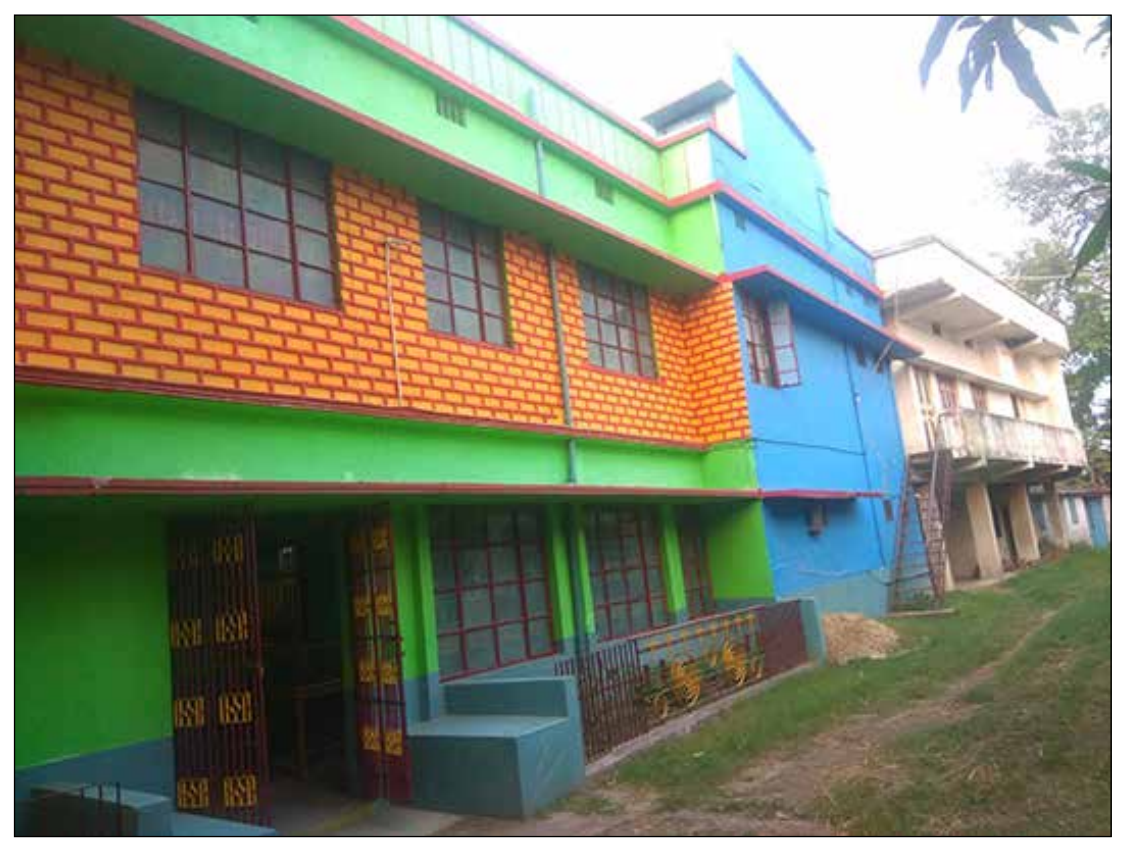
The Bridge Course program is operated in a separate building and offices on the grounds of the Sacred Heart Convent in Bettiah, Bihar. Sr. Crescence allowed the girls to select the colors of both the exterior and the interior walls.