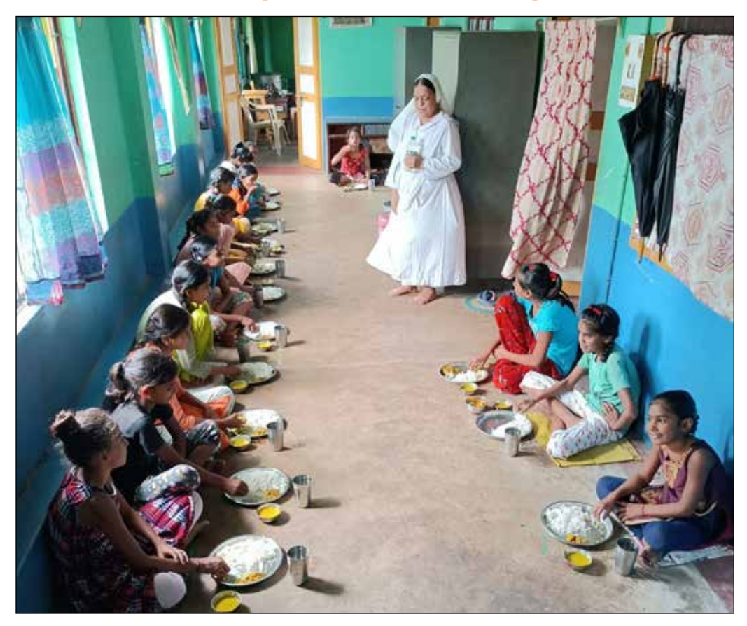
ABOVE: The girls having a meal in the Indian fashion. BELOW: Saying a nightly prayer before bedtime