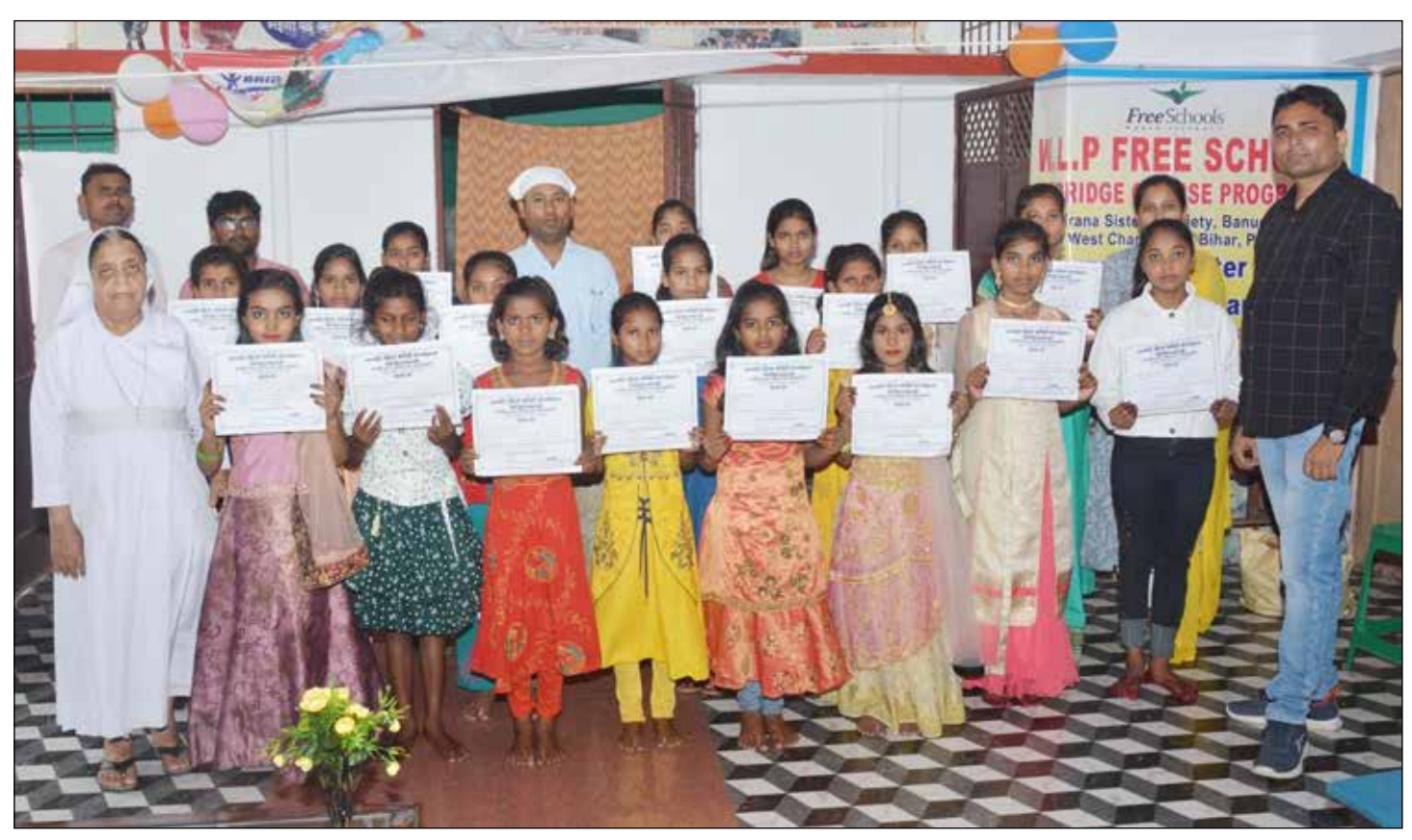
ABOVE and BELOW: The girls receiving their certificates according to merit at the completion of the year