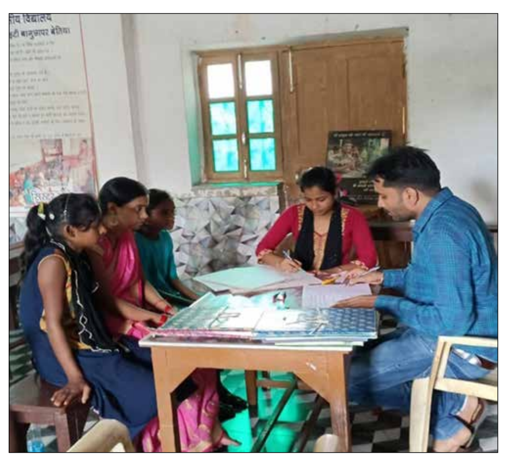
ABOVE: Girls being tested. BELOW: Girls say farewell to their mothers as they prepare to enter the Bridge Course