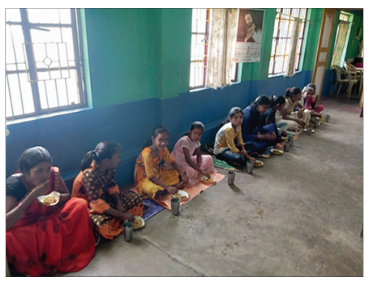
After writing their exams the girls take a meal in the Bridge Course dormitory building