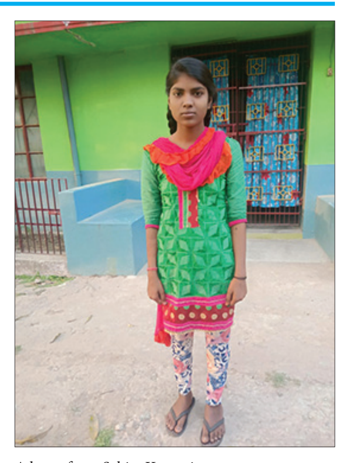
A letter from Sabita Kumari