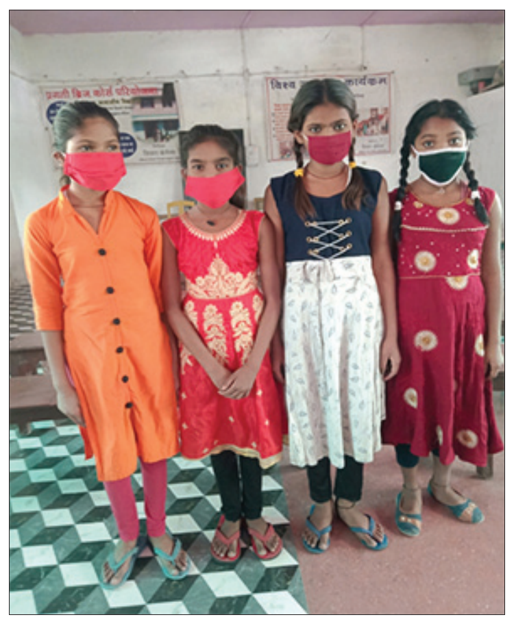
The four "old" girls who will join the new batch coming in