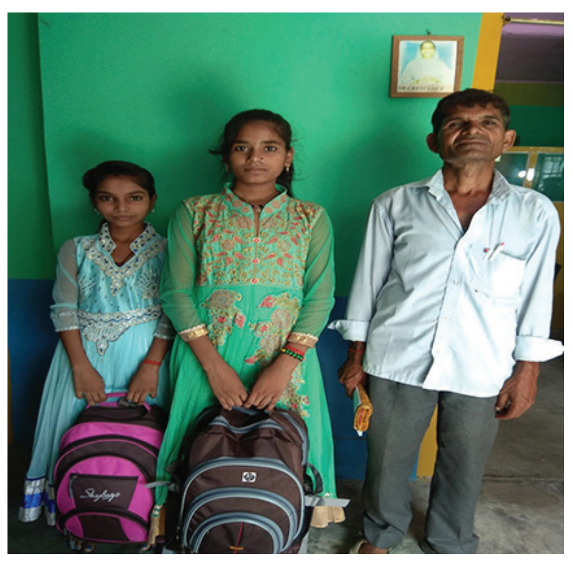
The child comes with the parents to get admission in Bridge Course