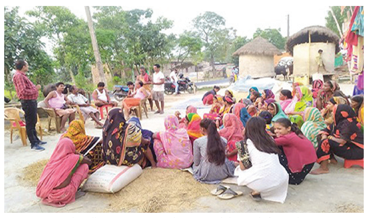
Meeting the villagers to motivate them to send their girls for Bridge Course