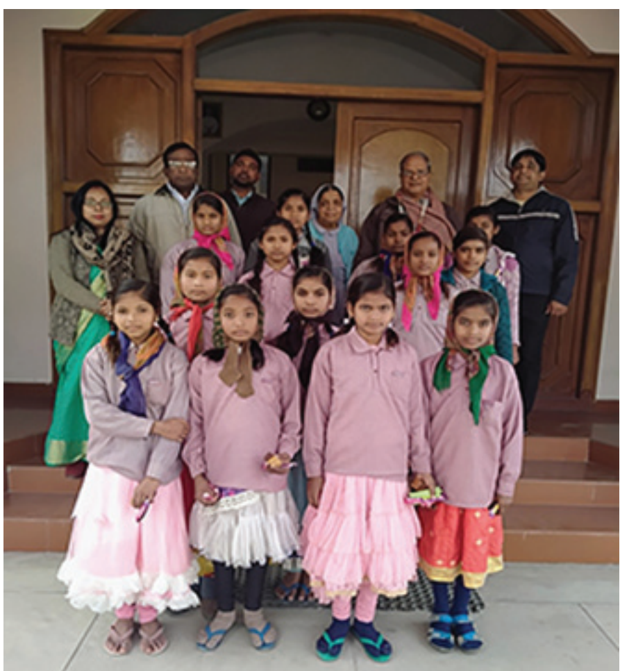
An excursion—a day out for the Bridge Course girls with a picnic lunch