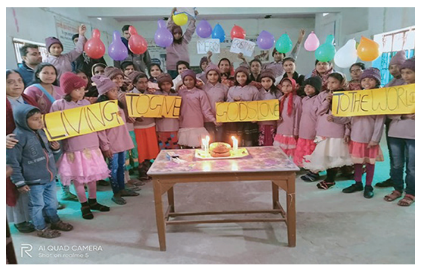
Christmas celebration with the Bridge Course girls