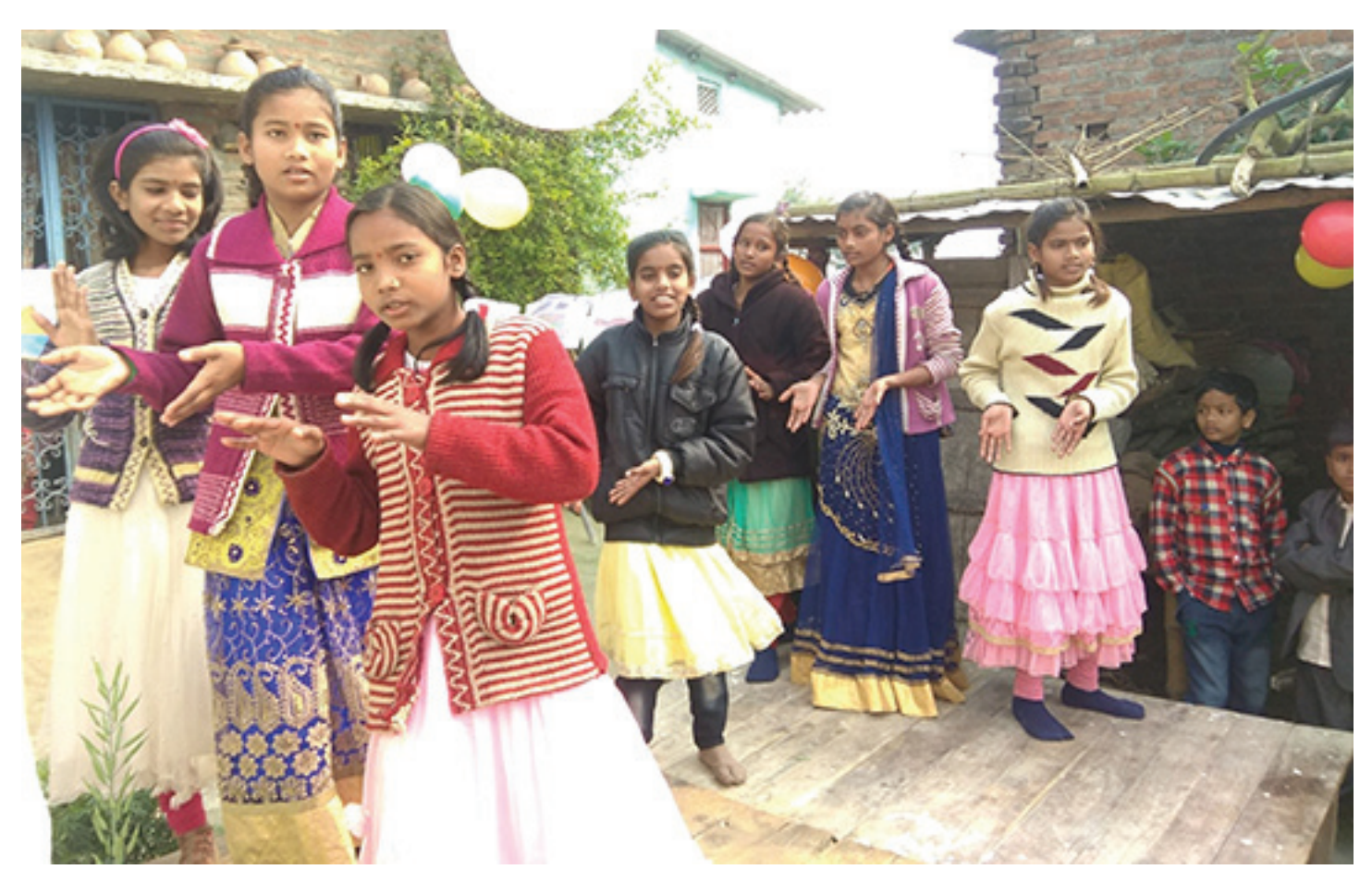
Bridge Course girls leading FreeSchools children to stage performance in village