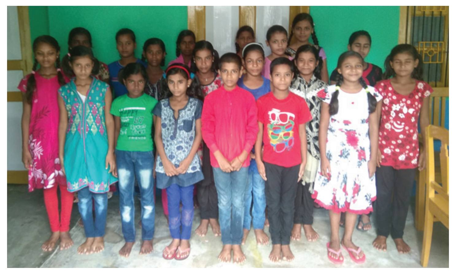
"Always dream higher and higher in life"