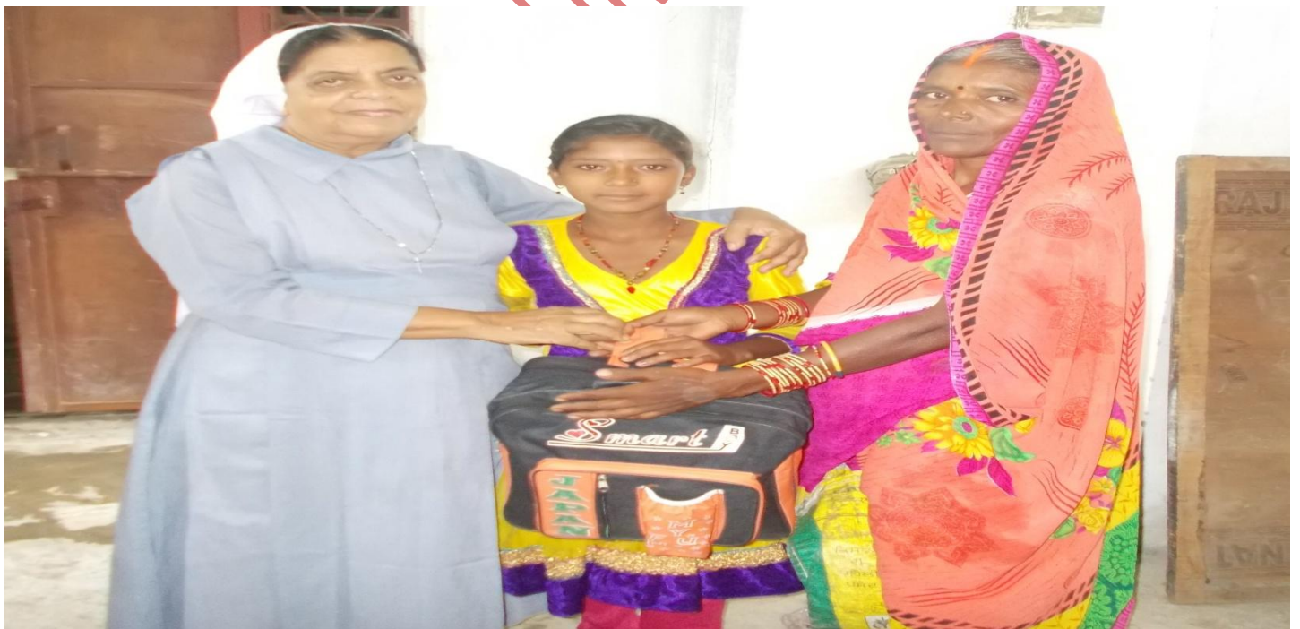
Final process- Receiving the girls after admission in the presence of their guardian.