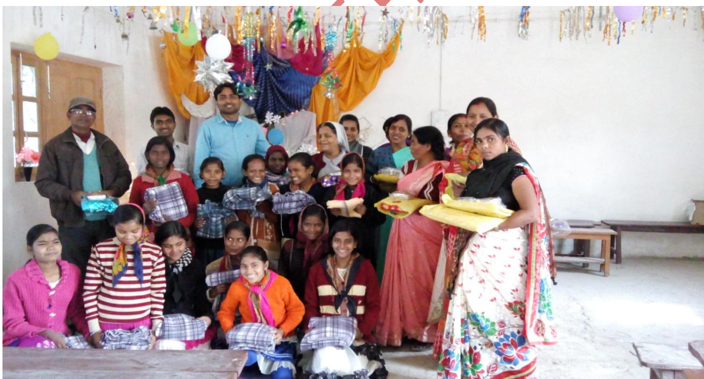
Bridge Course's girls during the Celebration on the Christmas Eve with the WLP's teachers and staffs.