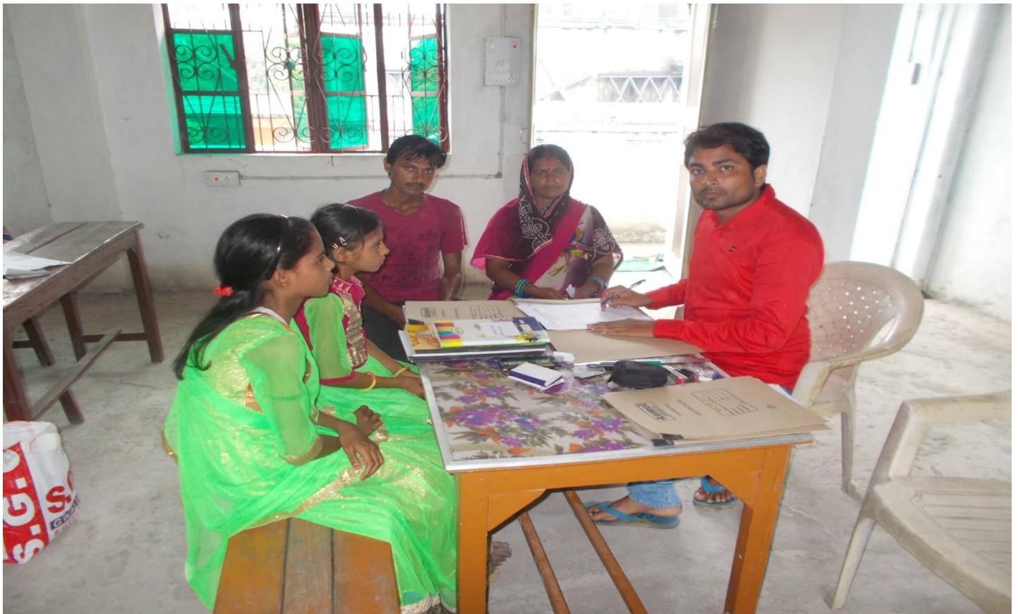
Third process- To take admission of the girls who have been selected in written test.