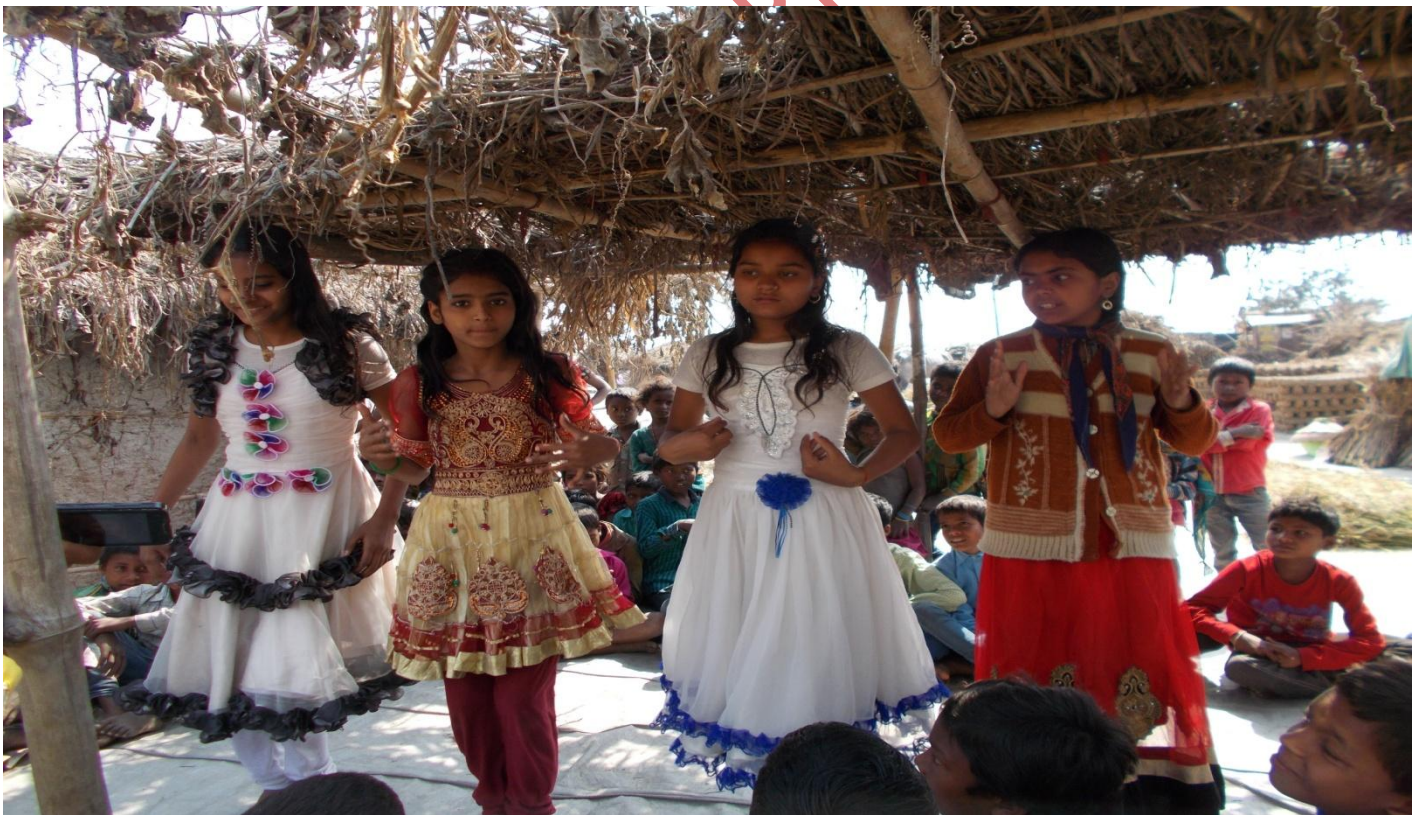
Bridge course's girls showing their talents and leadership during the WLP center visit.