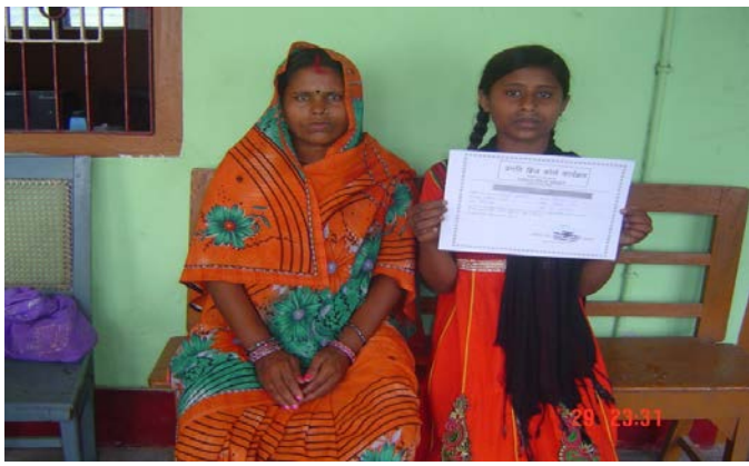
A passed out girl showing her certificate provided after the successful completion of Bridge Course Program.